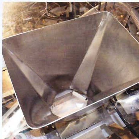
Wide loading chute prevents bridging.