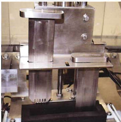
Quick release snorkels for easy cleaning.

Positive Vacuum and gas flushing allows precise O 2 control while eliminating pillowed or balloon packages. Smaller box sizes can be utilized to acheive reduced cubes.